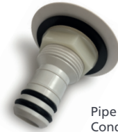
Pipe Connector for Condenser Drain Pan 21.5mm OD / 19mm ID Pt. B6400 (Bag of 1)